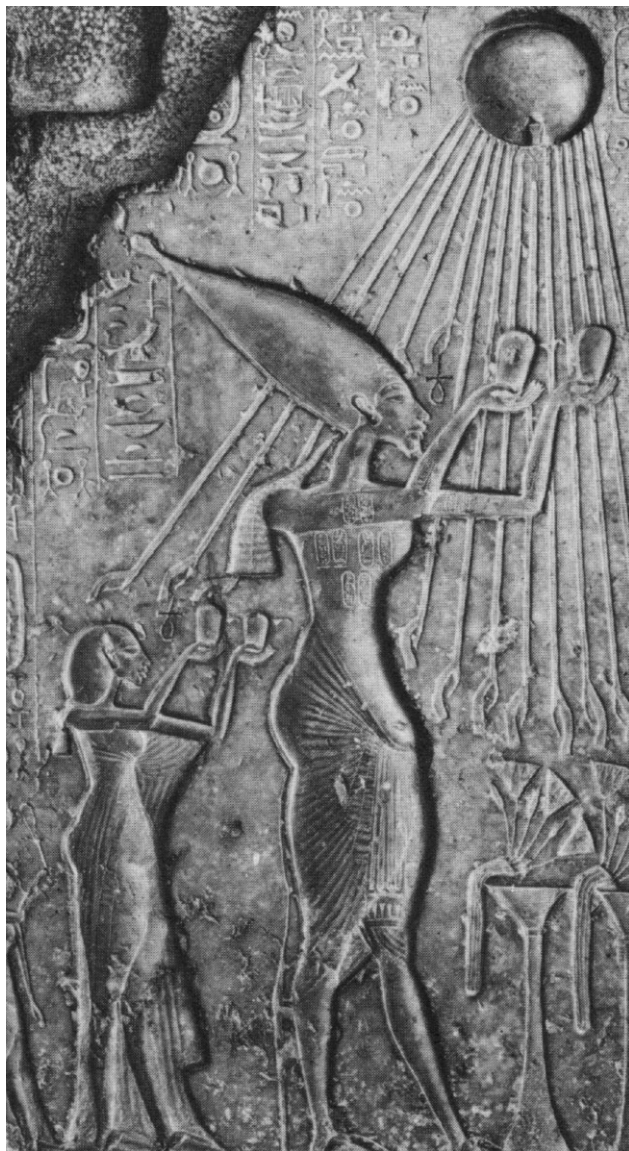
King Aknahton, 14th C. BC