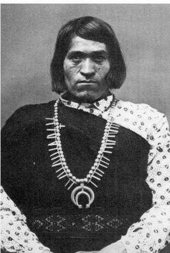
Native American Shaman

1904: French writer Colette experiments with androgyny and becomes part of a Parisian lesbian salon that included artist Natalie Barney, poet Djuna Barnes, and many other artists, actresses, and denizens of homosexual subcultures.