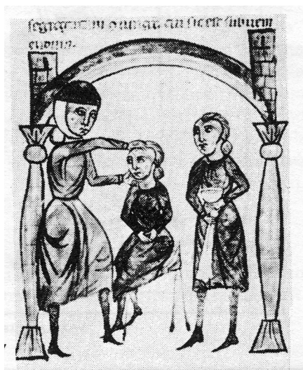
A Woman Healer, 14th C. AD

2004: Colombia's highest court rules to protect rights of intersex people and restricts authority of parents and physicians to authorize medically unnecessary surgery.