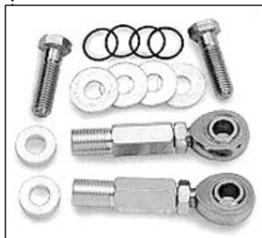
Modern Reproduction Tools

A term usually associated with disappointment in a much-requested new toy or food product. Closely related to BCWYWF (Be Careful What You Wish For - you just might get it.)