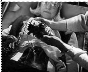
Installation of Maternal Instinct Monitor

batch processing Processing a group of documents or files all at once. In batch processing, the user gives the computer a job, for example, printing letters to everyone on a mailing list, and waits for the whole job to be done.