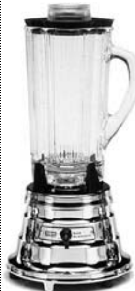
Post-Human Sex Toy

A candy egg or soft-boiled egg that is hidden in the house or yard for "hunting" during the Easter holiday season.